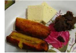
A traditional Guatemalan meal: fried plantains, cheese (it tasted like rotten milk with salt) and black beans

#7 The Tortilla Hut This is where the petite little "Tortilla Lady" completely hand-makes all the tortillas for the whole orphanage every day-usually for both lunch and supper! Every time I'd say hello to her, she'd greet me with "Hola nina", which in English means "hello child" (or little girl).