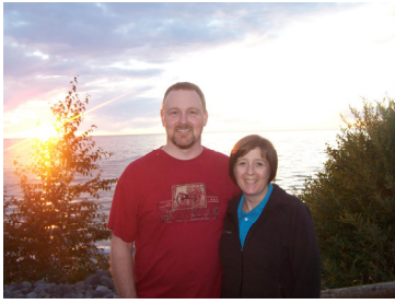
Our family is doing well.

As we prepare to start our fourth winter season here at Camp Barakel, I'm reminded of the history we share with the staff who have come before us. Those who broke the ground, cut the wood, built the buildings and did many other jobs that no one other than our Lord will ever know of. You see this year 2012 marks the 60th anniversary of camping here on Shear Lake. A lot has changed since the early years of Camp Barakel, staff, buildings, program activities, and even the meals. But one thing has not, and that is God's Word being the center of all we do here. That has been the main reason why I feel God has sustained Camp Barakel for 60 years.