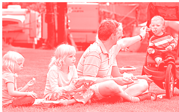
Family fun at the Barakel Picnic!

We'll do our best to offer you an enjoyable time for all the members of your family!