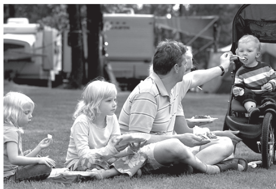
Family fun at the Barakel Picnic!

We'll do our best to offer you an enjoyable time for all the members of your family!